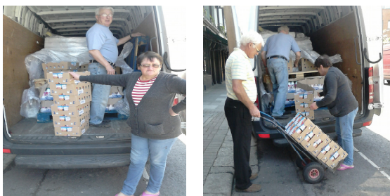
Heart To Hand volunteers delivering yogurt in Dublin recently.

Thanks also to Dockrell's Vegetable Farm, Enniscorthy, who keep us supplied with quality carrots which are excellent for soup and dinners.