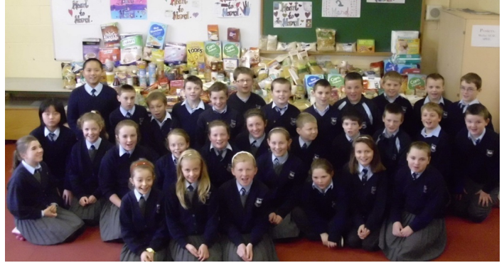
Photo shows 5th class students from Ferns, Co. Wexford following their very successful food collection.