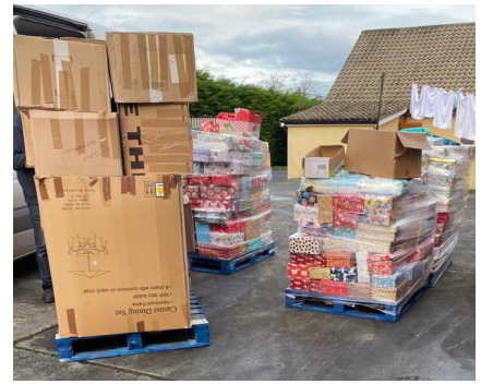
Christmas shoe box collections.

Christmas shoe boxes collected in Cork by our CORK volunteers. Massive thanks to all our volunteers who work hard collecting, food, clothes and Christmas shoe boxes during the year.