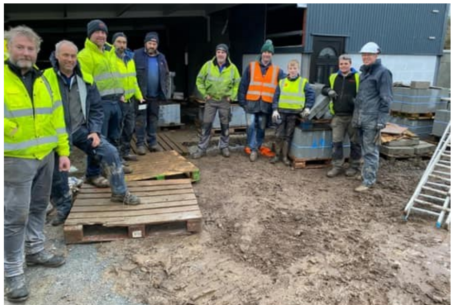
Heart To Hand volunteers from Gortnahoe here working with Gleeson Steel.

Thanks to all the Heart To Hand volunteers who took part in the build, helped with materials and plant, supplied food and helped with the lunches on site. Big thanks to all those who gave their time to come and help every week. Thanks to Down syndrome Tipperary for their kindness and support all through the project.