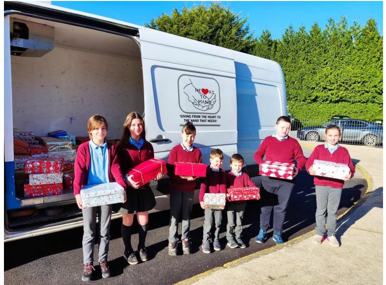
Borris National School .