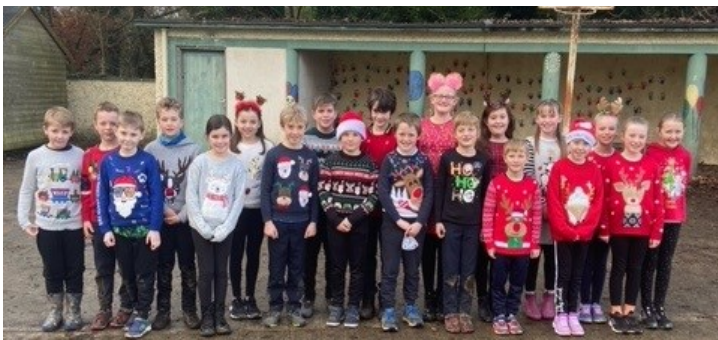
Rathcoyle national School