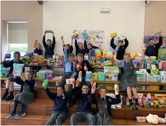
Scoil Naomh Maodhóg

Heart To Hand would like to say a massive thank you to all the schools that participate in our Christmas shoe box collection and our food collections. We are extremely grateful to all involved . To the students, their parents, the teachers and all those who organise these collections we want to thank you.