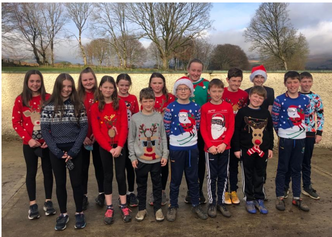
Rathcoyle national School