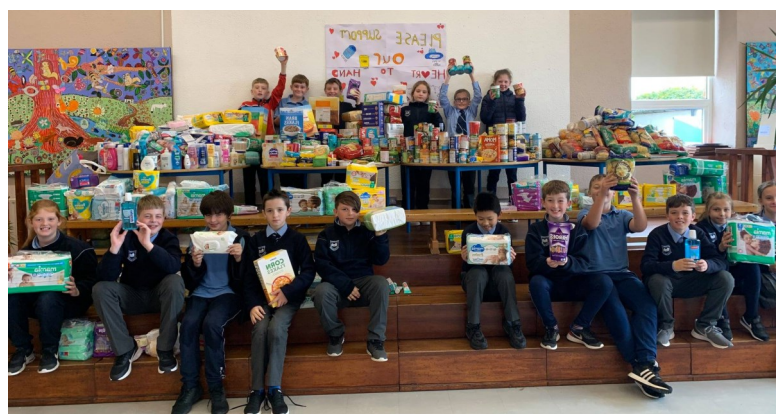
Scoil Naomh Maodhóg