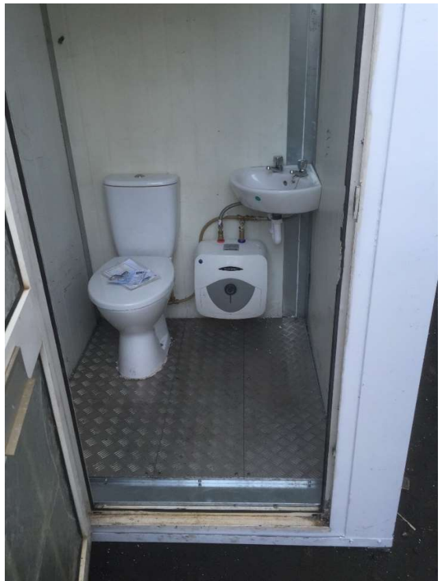
All sanitary ware by Grafton Group.