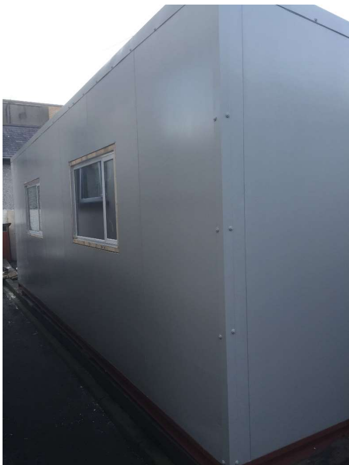
Completed workshop external.