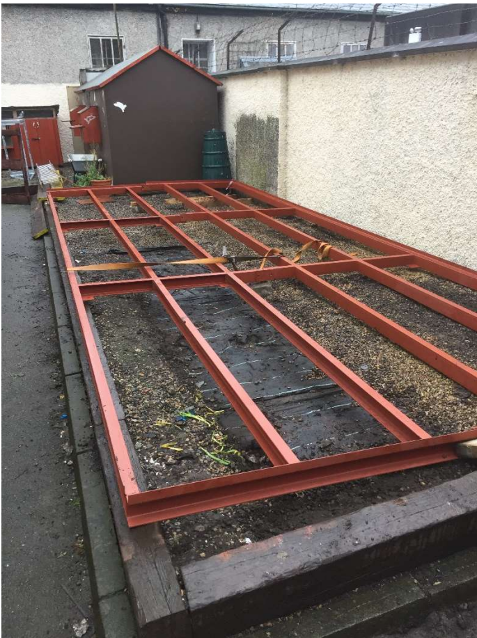
Base Frame installed and levelled.