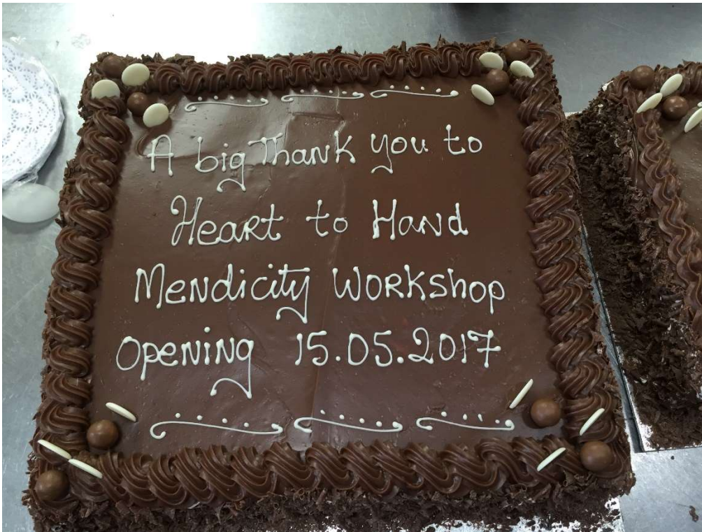
Cake made for the official opening of the workshop!