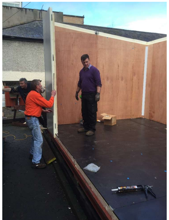
Side panels in progress!