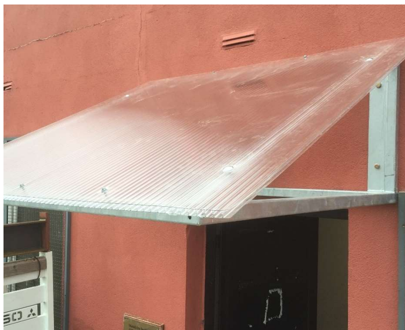
Completed canopy at the front door.