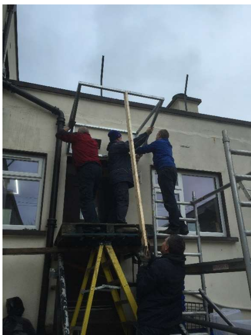
Canopy installation to the rear entrance.