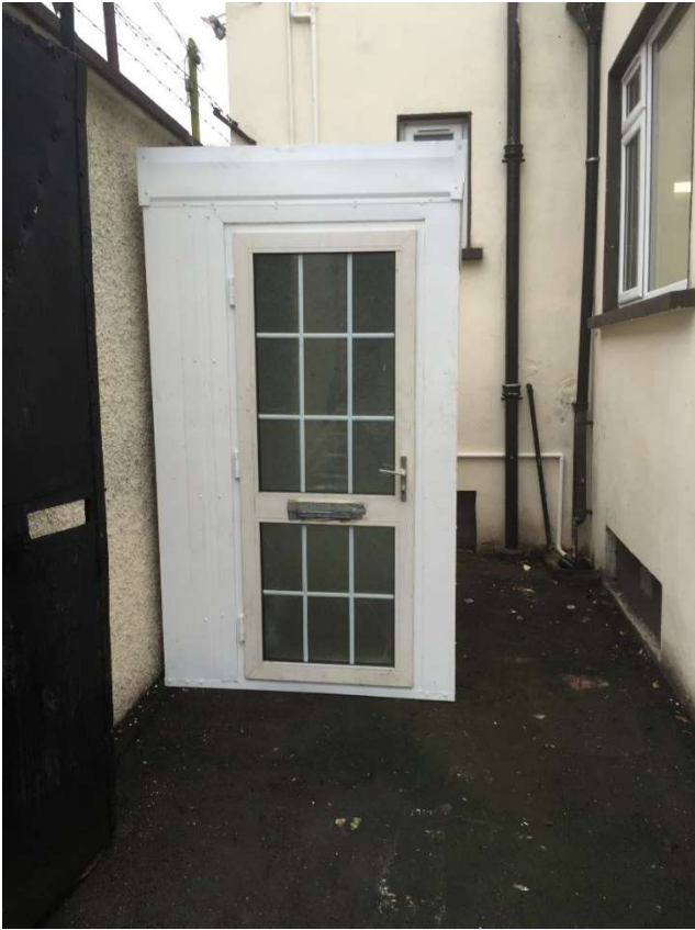
External Toilet donated by Gleeson Engineering.